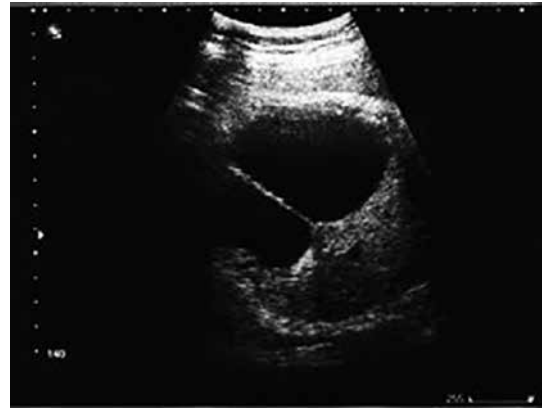
Figure 1. Ultrasound revealed a well-defined, echo-free cystic mass measuring 8 cm × 10 cm on the right side of her uterus with partial septations

For most premenopausal patients with OT, detorsion and ovarian conservation is recommended rather than salpingo-oophorectomy. Ovarian cystectomy is often performed if a benign mass is present. Cystectomy significantly reduces the risk of re-torsion by 50–75%, compared to detorsion. In recurrent cases, ovariopexy is preferred in order to reduce the risk of recurrence [9]. Patients with an ovarian mass that is suspicious for malignancy