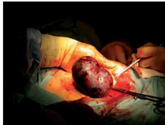
Figure 2. Tortured necrotic ovarian mass found at laparotomy