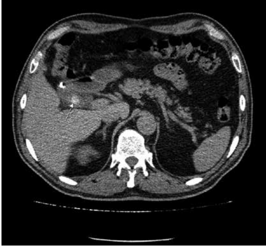
Figure 1. Abdominal CT axial plan – remnant gallbladder stone